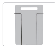
Tabla de paradas para masaje cardíaco CPR cardiac board with support