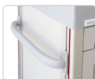
Empujador de ABS Ergonomic ABS pusher