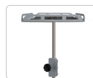
Soporte para desfibrilador Defibrillator support