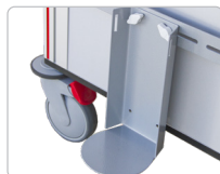
Soporte para bombonas Oxygen tank holder