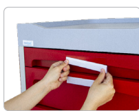
Sistema portaetiquetas Label holder system