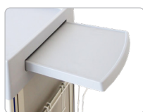
Mesa extraíble Sliding table